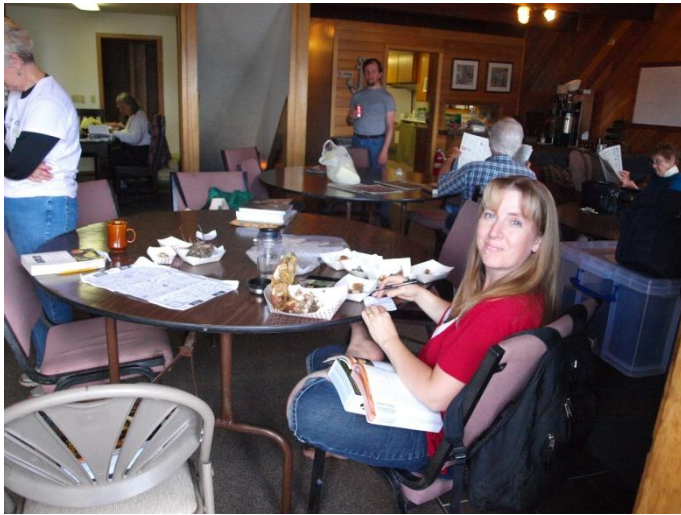
Foray-goers were back at Lakeside after lunch to get serious about learning how to identify mushrooms.